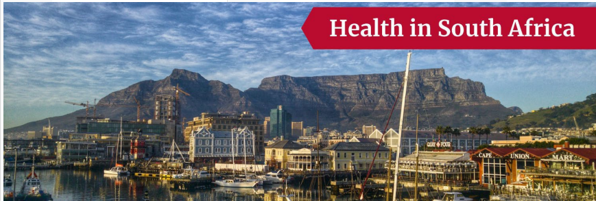
Health in South Africa